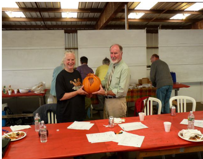
Auctioneer and Winner in the Border Pumpkin BT Rescue Event